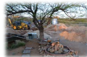
Ray installed Pebble's septic leach field.