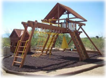
The new Pebble play area!