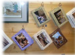
Burns Family Photo project

A user request for printed Precalc lessons got me going. Now, all of my 400+ math lessons (and more) are available .